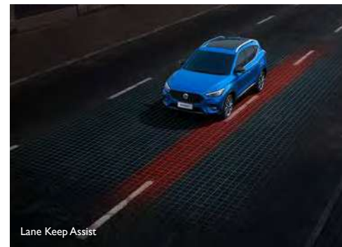
Lane Keep Assist