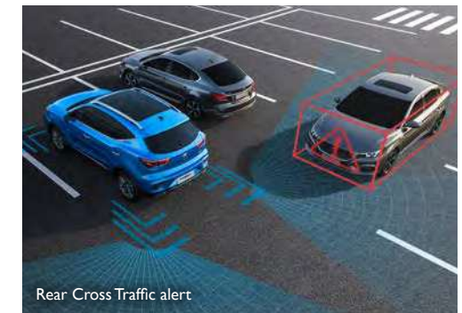
Rear Cross Traffic alert