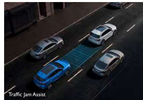
Traffic Jam Assist