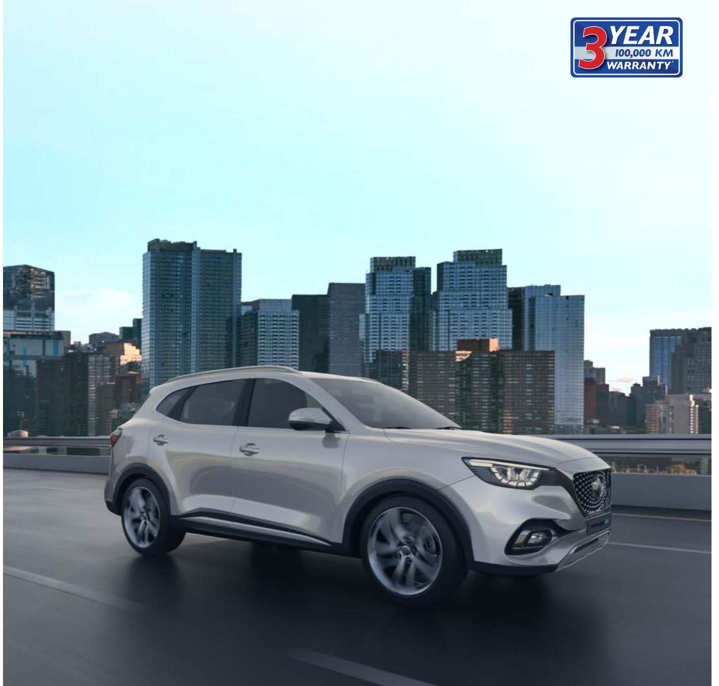
^!Available on Essence

The above safety features are driver assist technologies that are not a substitute for safe and attentive driving or for the drivers control over the vehicle.